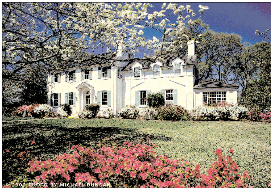
A home in East Hill, one of several historic residential neighborhoods in Pensacola.