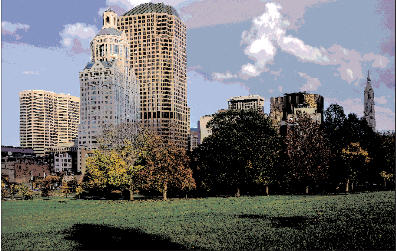
Hartford's skyline rises behind Bushnell Park. On the far right is the Travelers Tower, built in the 1920s and for many years the tallest building in New England.

Insuring the Future Hartford, Connecticut revisits a chapter of its history this summer with a replica of the schooner Amistad , but the ship's visit also hails dynamic plans for the 400-year-old city's future.