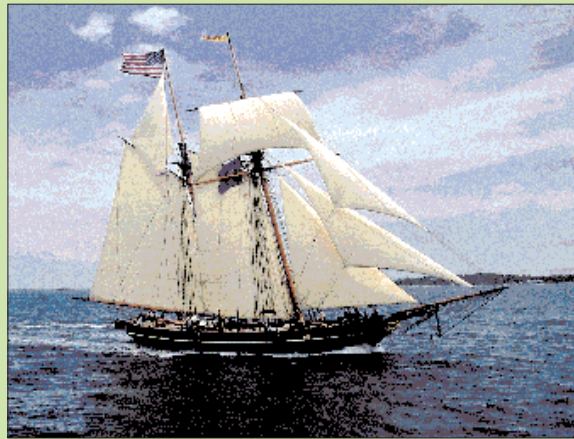
The Freedom Schooner Amistad, a replica of the 19th Century schooner, built at Mystic Seaport.

The 43 surviving Africans were jailed near New Haven,