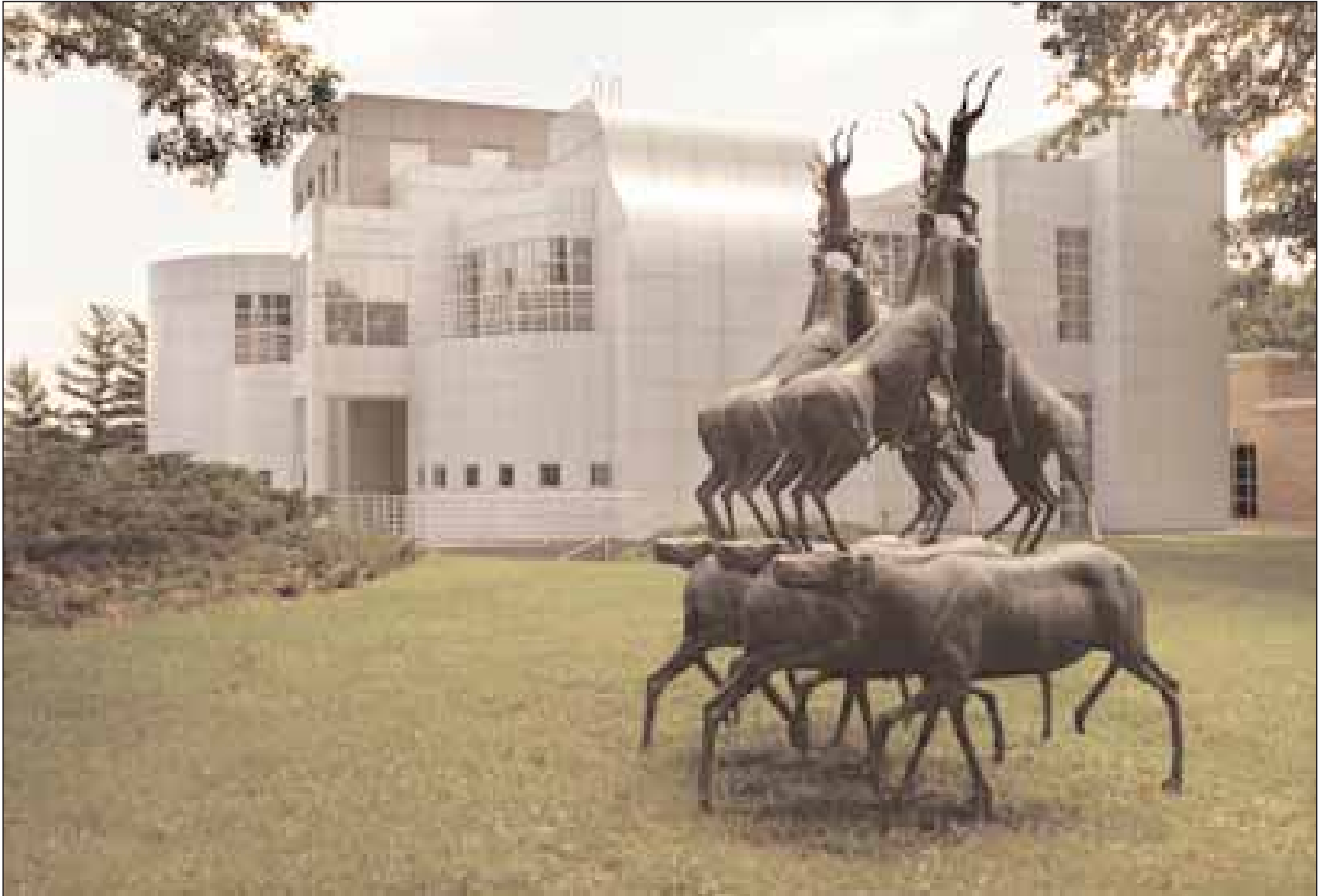
ABOVE, This wing of the Des Moines Art Center, completed in 1985, was designed by Richard Meier. Bruce Nauman sculpted the "Animal Pyramid."